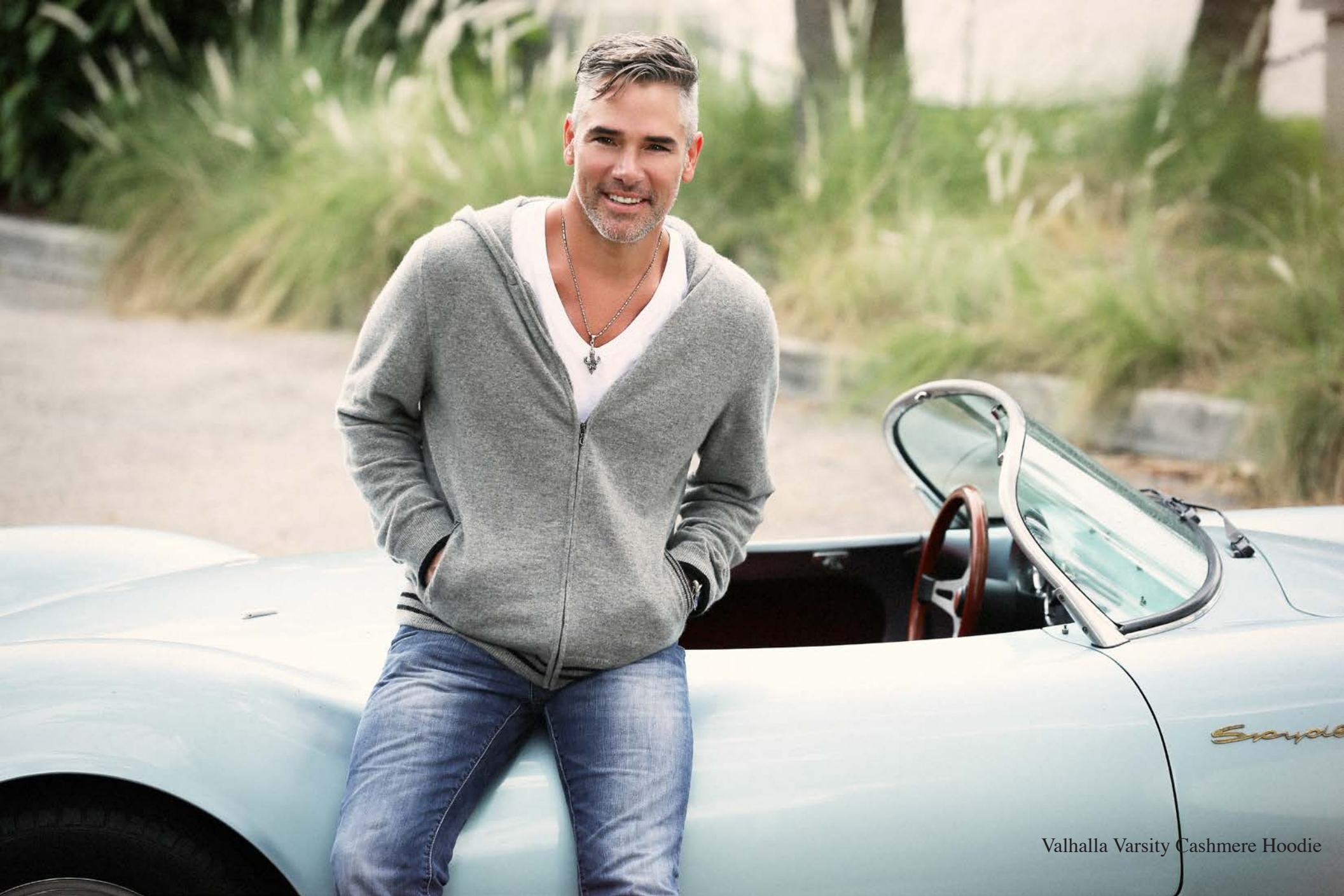
Valhalla Varsity Cashmere Hoodie