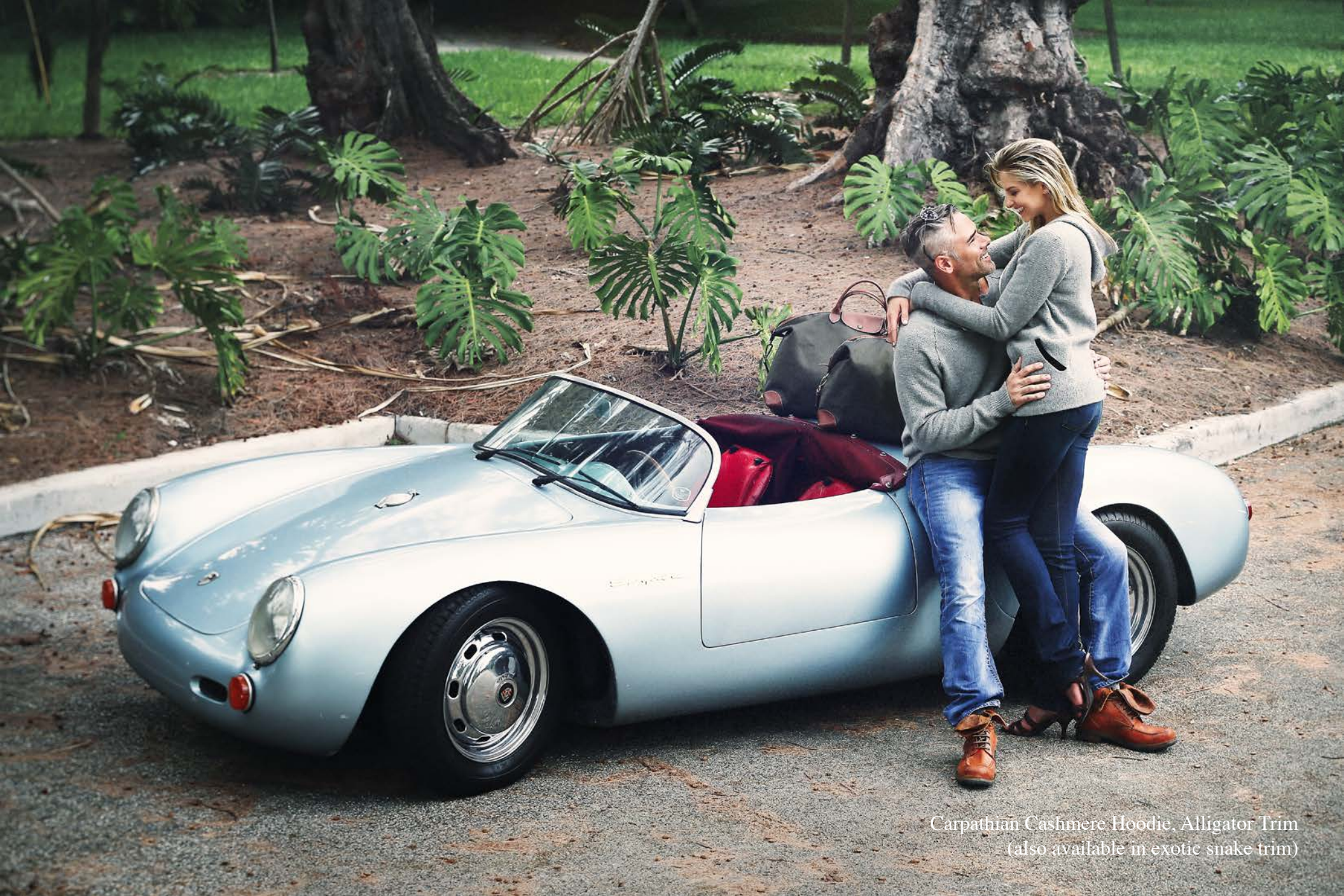
Carpathian Cashmere Hoodie, Alligator Trim (also available in exotic snake trim)