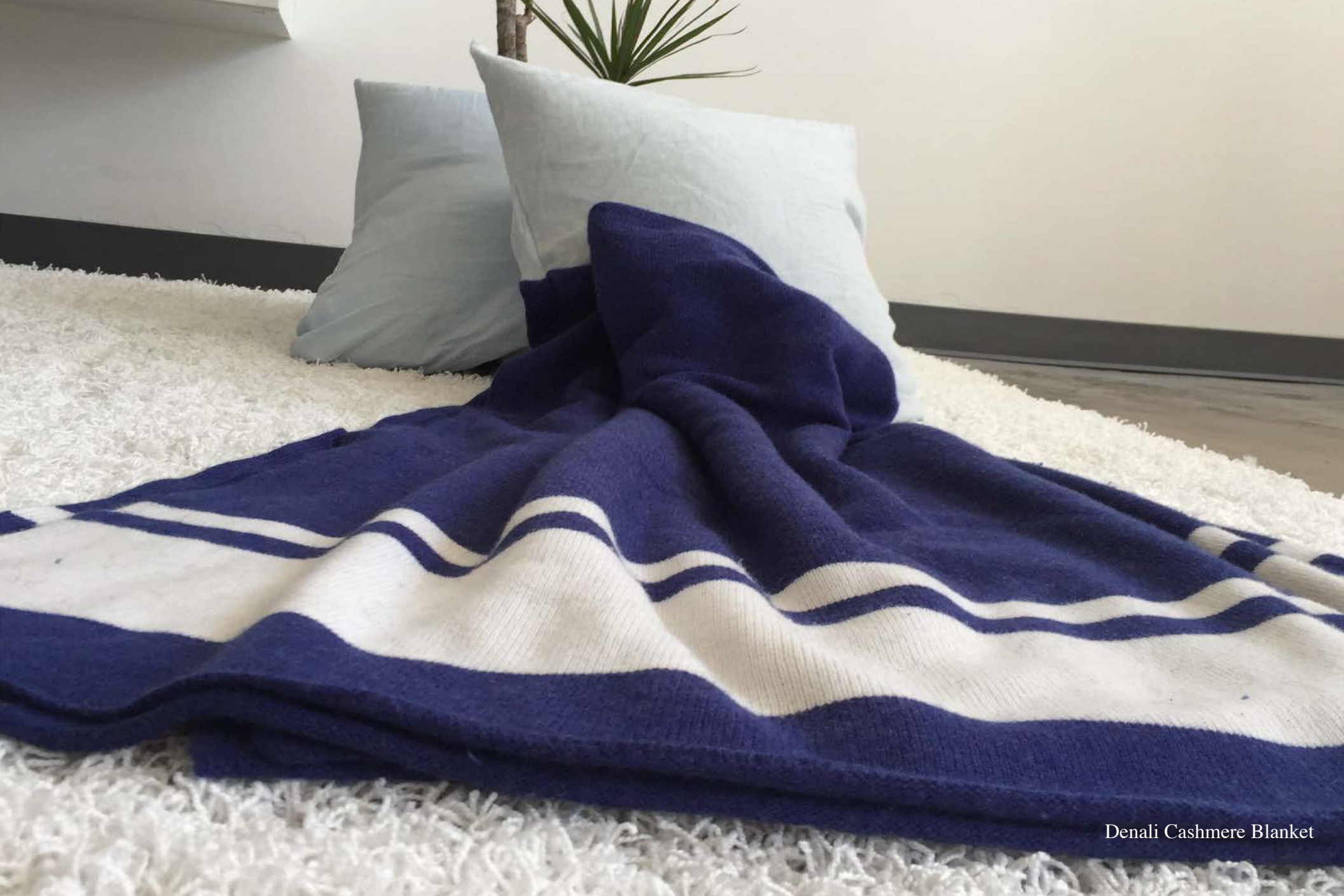
Denali Cashmere Blanket